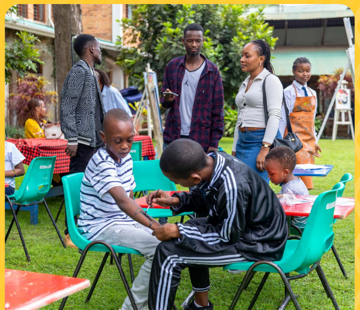
Family fun day: The day event featured live painting, food vendors, face painting, sip and paint, and children's activities.