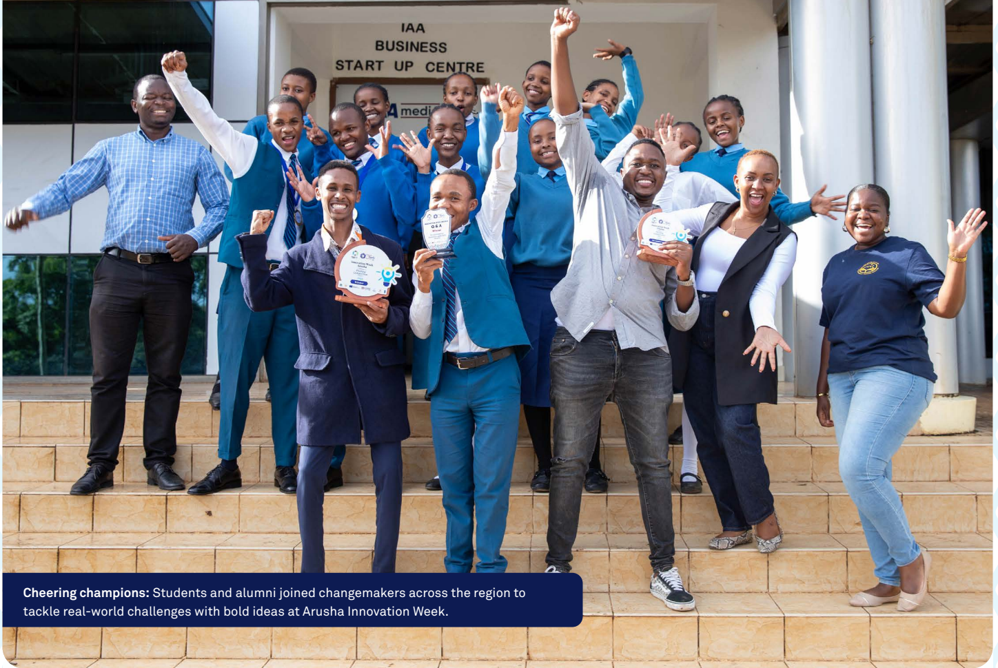
Cheering champions: Students and alumni joined changemakers across the region to tackle real-world challenges with bold ideas at Arusha Innovation Week.