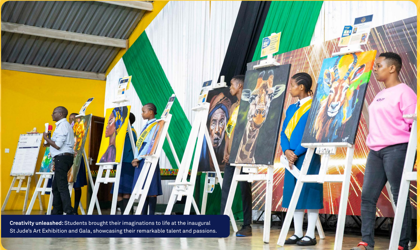
Creativity unleashed: Students brought their imaginations to life at the inaugural St Jude's Art Exhibition and Gala, showcasing their remarkable talent and passions.

Inside St Jude's first Art Exhibition and Gala.